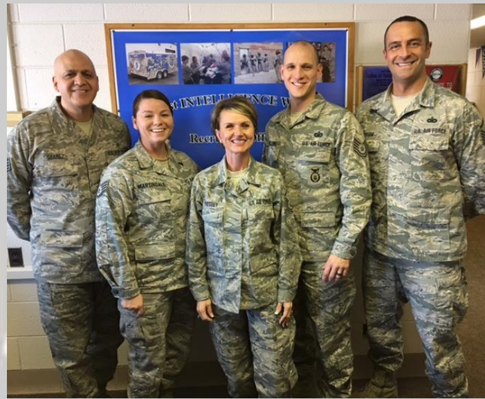
181 st R/R Team

Contact an Air National Guard Recruiter at (800) 851-5937 for the current list and to learn about current incentives for the positions.