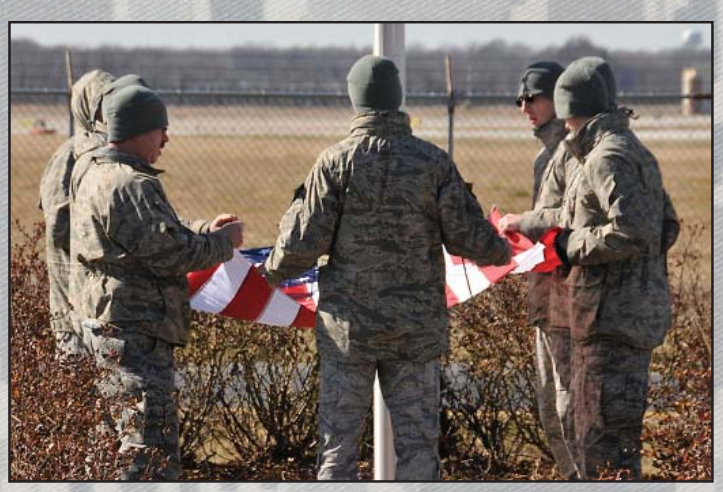
Members of the 181st perform retreat ceremony during the Feb UTA.