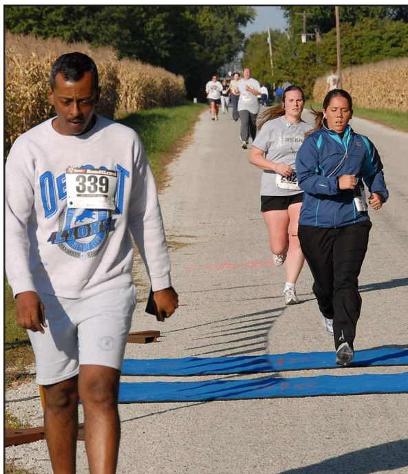
Members push hard as they near the timing carpet to complete their 1.5 mile "Fun Run".